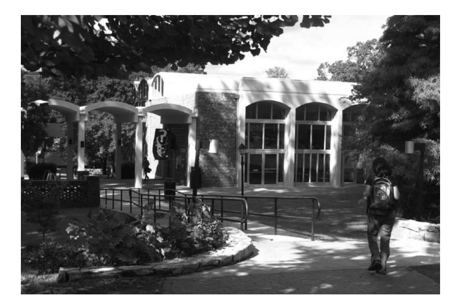
"What we do in college is to get over our littlemindedness. To get an education you have to hang around till you catch on." —ROBERT FROST