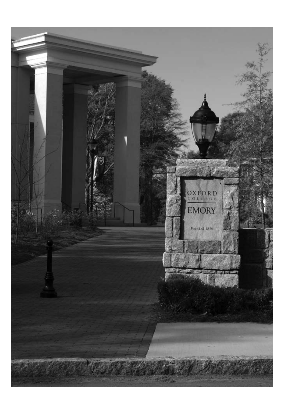
"The real voyage of discovery consists not in seeking new landscapes but in having new eyes."