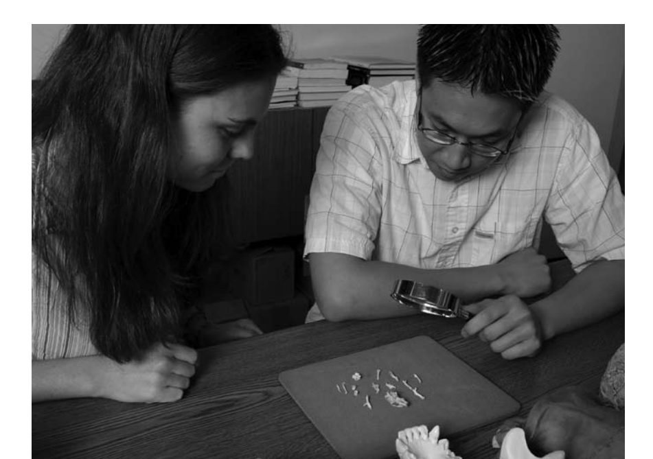
"Education is not the filling of a pail, but the burning of a fire." — WILLIAM BUTLER YEATS