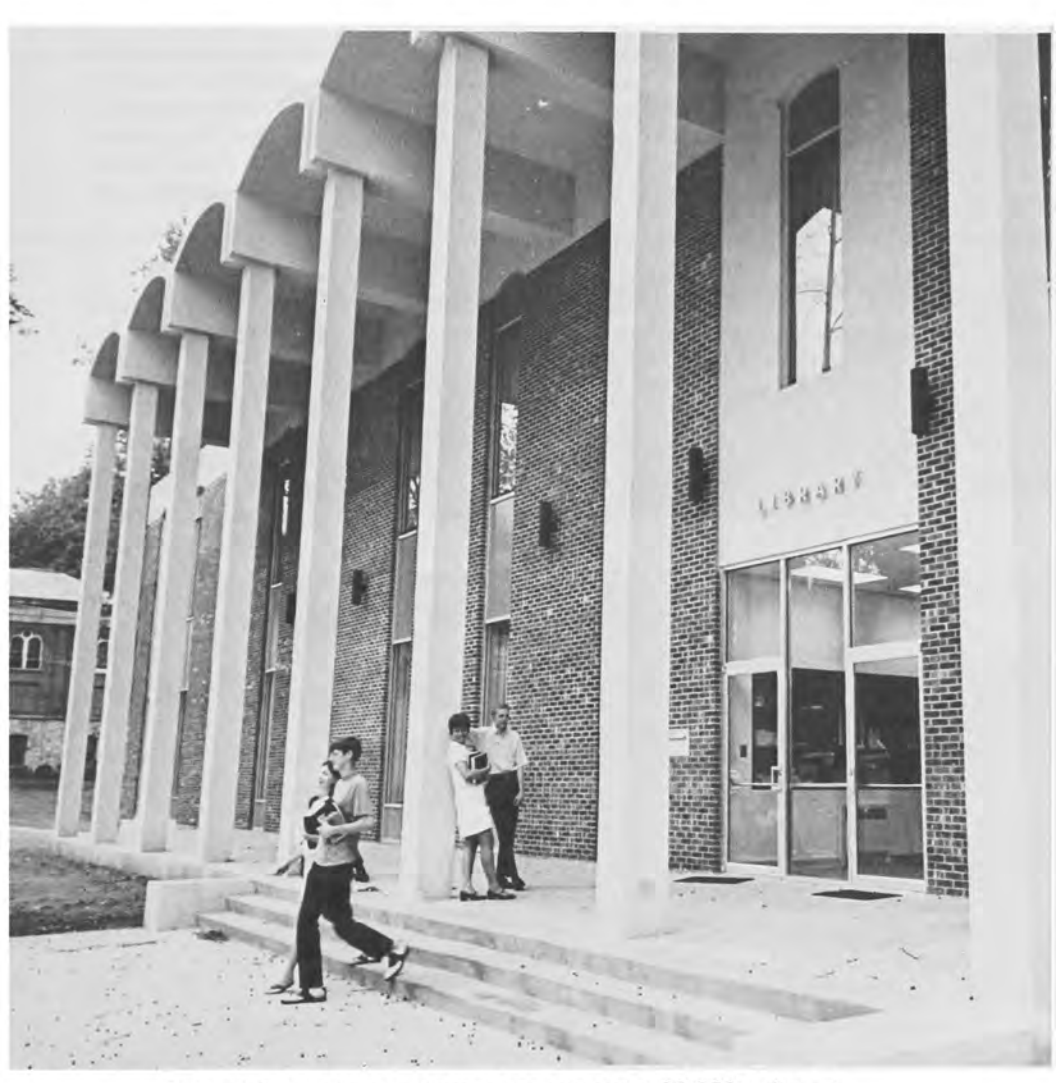
Oxford College's new library houses some 23,000 volumes.

Future Teachers. Loans from the National Defense Education Act are available for students planning to enter the teaching profession. One-half the total amount of the loan is cancelled when students become teachers and have completed the time required for this consideration. For students from Georgia, there is a State Teachers Scholarship.